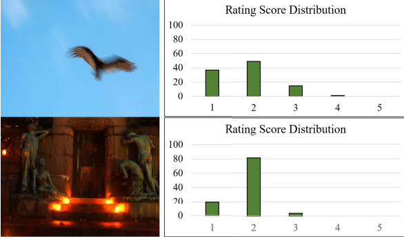
Fig. 2. Examples from the KonIQ-10K database. They have similar MOSs (1.804 vs. 1.848), but are with different rating score distributions.

where B^L and B^U denote the number of labeled data and the number of unlabeled data in a mini-batch, respectively. \tilde{y}_t^\kappa \in \mathbb{R}^{1 \times P} and \tilde{y}_s^\kappa \in \mathbb{R}^{1 \times P} ( \kappa \in \{i, j\} ) respectively indicate the output of teacher and the output of student, where P refers to the maximum scoring scale. By minimizing \mathcal{L}_s^U during the training process, the network would enforce the student to mimic output activations of individual examples represented by the teacher.