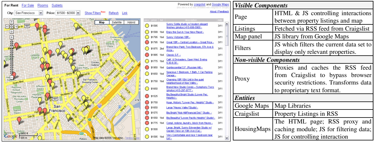
Figure 1. Decomposing a mashup - HousingMaps.com

lines of code – often astonishingly less than building the same functionality from scratch, and without the need to manage seed data. However, effective glue code snippets can be very complex to write or discover so that the word "just" becomes highly ironic.