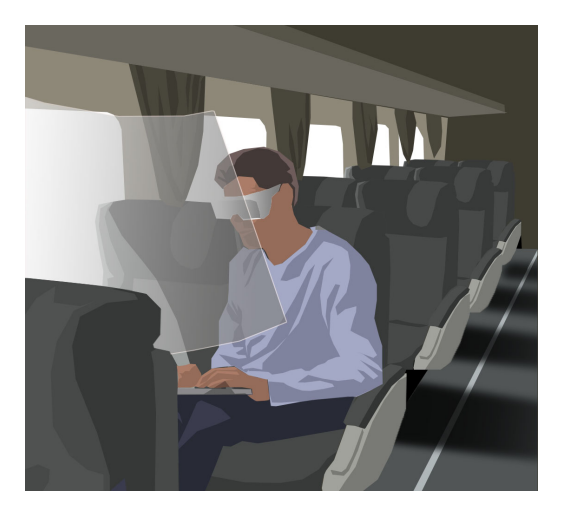
Figure 2: A vision of a portable virtual office enabled by VR.

In this paper we focus specifically on investigating the method for virtually representing a user's hands in VR in several different ways. One possibility is to not reveal the hands at all, or resort to simply visually indicate to the user the actual pressed keys [40].