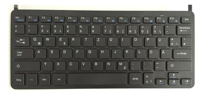
Figure 4: Physical keyboard used in the experiment.

For finger tracking, individual retroreflective markers were attached to the nails of participants using double-sided adhesive tape, see Figure 3, bottom right. The finger calibration aimed at determining the offset between the tracked 3D position of each finger tip and its corresponding nail-attached marker. To this end, the participants were asked to hit three soft buttons of decreasing size (large: 54 \times 68 mm, medium: 35 \times 50 mm, small: 15 \times 15 mm) on a Nexus 10 touch surface. Initially, the virtual finger tips were shown at the registered 3D positions of the retroreflective markers. On