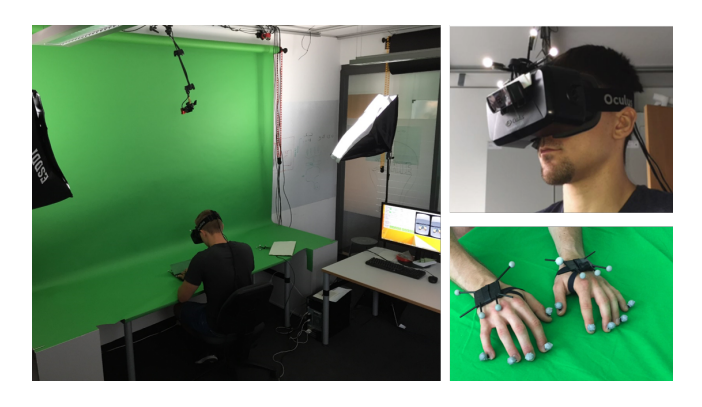
Figure 3: Left: Setup with green keying, tracking system and external lighting. Top right: HMD with external camera and tracking fiducial. Bottom right: fiducials used for tracking the hands in the IKHAND condition.