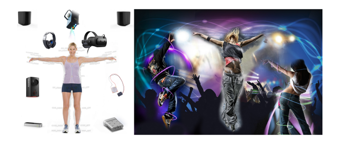
Figure 1: Imagine you feel lonely at home and wish to dance with somebody. You invite both your real friends and artificial intelligence (AI)-driven characters for a virtual house party in your living room to dance together. You can feel their touch and dancing bodies next to you and you are all enjoying this spontaneous party. You feel connected to the others and not lonely anymore. Augmented remote dance aims to overcome current challenges of learning practices hitherto restricted to the same physical space.

dren and is attested universally across world cultures [25]. Dance uniquely combines thinking, feeling, sensing, and doing. It has strong effects on physiological and psychological well-being, combining the benefits of physical exercise with heightened sensory awareness, cognitive function, creativity, inter-personal contact and emotional expression [11, 25]. This is why in CAROUSEL+ we have chosen dance as vehicle to implement our vision.