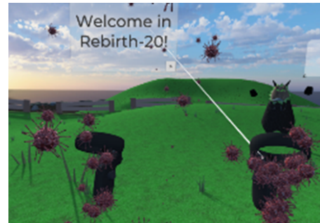
Figure 1: The Rebirth-20 application.

We know now that the COVID-19 attacks the lungs. The lung is the most frequently affected organ in the disease, and epidemics caused by other coronaviruses such as Sars-CoV and Mers-CoV have shown that pulmonary fibrosis may persist after the initial infection. Interstitial pulmonary fibrosis is a frequent consequence of the respiratory distress seen in the acute phase of the disease. It