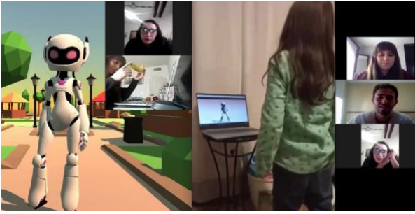
Figure 1: Left: Character implemented in Unity in the second iteration, Right: Child interacting with the IVA assessed by an expert.