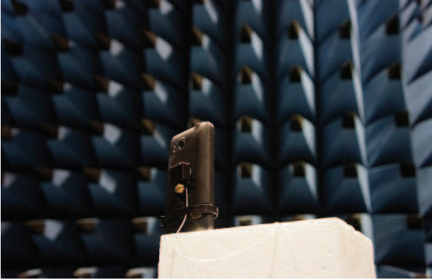
Fig. 4. Measurement set-up with optic fibers.