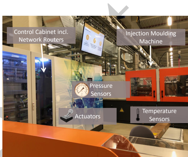
Fig. 1. IIoT components in modern factories

Digitalization, Industry 4.0 or Advanced Manufacturing are programs which are pushing the progress described before. Additionally, they are bringing the flexibility of production sites and systems in the digital era onto a new level which leads to new constraints and requirements regarding the communication networks [3]. Although the basic concepts are used for many decades now, production sites and systems are optimized using methods like the Toyota Production System, the Lean concept and many other techniques. These require a continuous improvement of the whole setup of manufacturers, meaning that machines and components are physically moved around the site to increase the flow of produced parts and products [4]. Additionally, the demand for individual personalized products is increasing, not only for consumer products, but also for professional products. Although the programs mentioned before go into the direction of increasing flexibility in production sites, the impact of physical flexibility