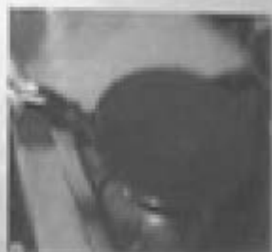
water in pan