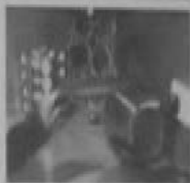
no water left in pan