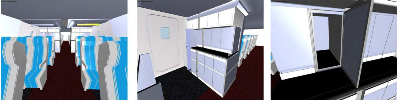
Figure 1. Images taken from the SE of the airplane cabin with the galley.