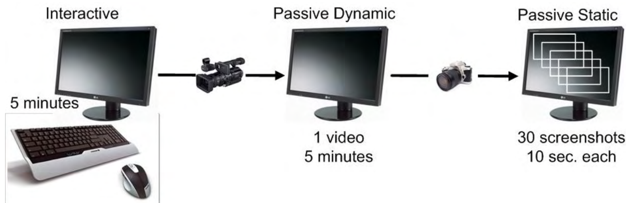
Figure 3. The three conditions of the learning phase, to which the participants were randomly assigned. Please note the relation between these conditions.