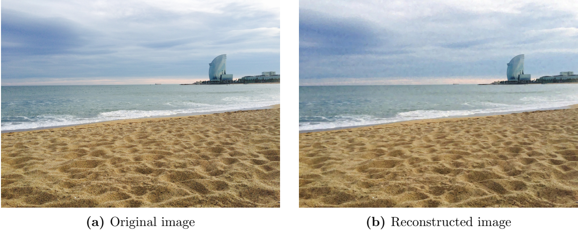
Figure 2: (a) Image of a beach in Barcelona, Spain. (b) Reconstructed image obtained from nonlinear observations (quantized (DCT) coefficients to 16 levels and then subsampled the observations by a factor of two). Reconstructed PSNR=27.5944.