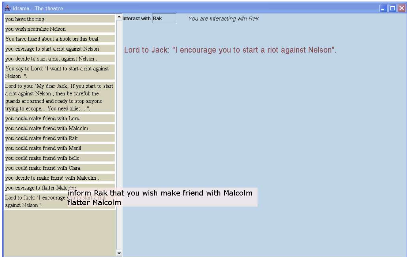
Figure 3. Screenshot of PastMaster . The user is talking to Rak about Malcolm.

In addition, to limit the number of choices provided at the second level, the user chooses who s/he is interacting with (the addressee), using a simple choice list (see Figure 3). Note that in a future graphic implementation of the stage (typically in real time 3D), the selection of the addressee will occur naturally, through the user's navigation.