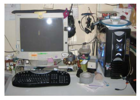
Figure 3. P4 builds her own computers.