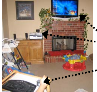
Figure 1: This digital home includes a large high• definition display, a wireless • media center PC connected to an upstairs desktop PC, and wireless keyboard and mouse.

We call this overhead of making digital devices support a person's desired activities problem-time . Designers and manufacturers have worked to lessen problem-time in various ways since the inception of human-computer interaction. "Usability", "ease of use", "out-of-box (OOB) experience", and "seamless interoperability" are all terms that describe design goals to decrease the problem-time a user experiences (e.g. [4, 5, 7]).