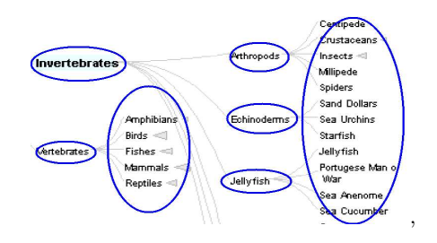
Figure 3: Different proximity-based groups as defined by our model.

ACT-R[1] is a production-system–based cognitive architecture that has been extensively used to model various aspects of human cognition, from memory and problem solving, to language and web browsing. ACT-R resembles a programming language in which all the constructs have some psychological validity. For instance, once such construct is the retrieval of a piece of information from memory. ACT-R imposes various constraints on its constructs; for example, the time needed for a retrieval operation is well specified; also what kinds of items you can retrieve from memory at any given moment. These constraints are backed by many psychology studies and models of human cognition. All the constructs in ACT-R can be put together in a program called a computational model. A computational model for a task is an ACT-R program that does the task and embodies a theory about the mechanisms that humans deploy when solving that task. Because ACT-R specifies a certain granularity