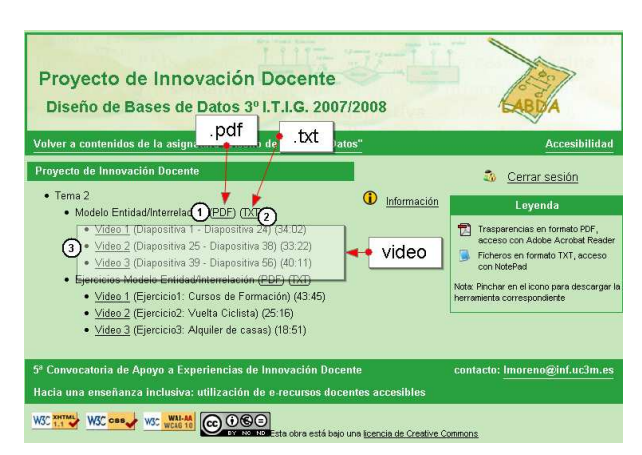
Figure 2. Alternative resource formats in didactic unit

These content materials comprise two didactic units, a theoretical one (Entity Relationship Model) and a practical one (Entity Relationship Model Exercises). For pedagogical reasons, each unit is divided in three different videos in a sequential order with an approximated duration of 30 minutes offered in several formats. In addition, support information is enclosed to each unit in different formats (video, .pdf and .txt) as shown in Figure 2.