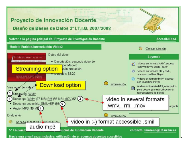
Figure 3. Options to diffuse the video and video formats