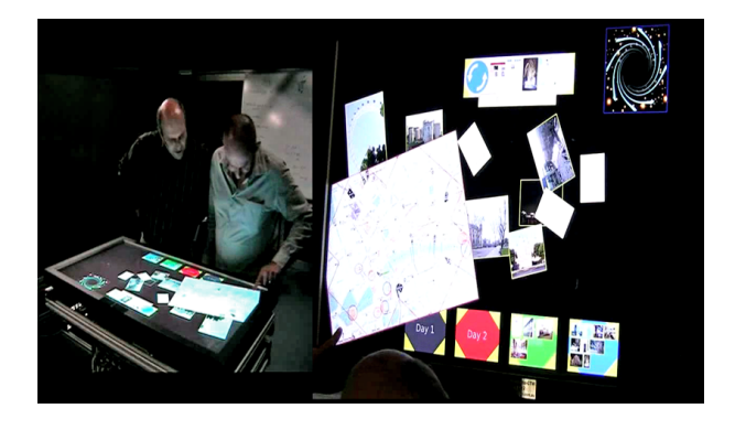
Figure 2. Two people accessing their personal file collections at a tabletop using Focus (left), and a view of the screen (right) showing similar files to the current 'focus' file (a map of tourist attractions, which has also been enlarged by one of the people).

In the last section, we explained the configuration for the familiar Explorer ; for the alternate interface, Focus , a new experimental system, we now briefly describe the user view.