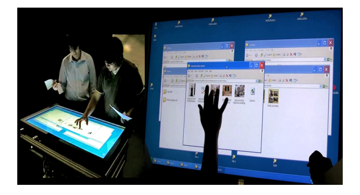
Figure 1. Two people accessing their personal file collections at a tabletop using Explorer (left), and a view of the screen (right) showing their separate file collections on each side of the table, with the folder they are currently discussing moved to the middle.

window. To support multiple people accessing their file collections, it is natural to assume that each person would use their own separate window to access files, and so we chose a spatial configuration for our study. Figure 1 shows our setup, where two people are accessing their file collections on separate sides of the table.