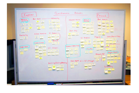
Figure 4. The affinity diagram containing qualitative feedback obtained from the post-experiment questionnaire.