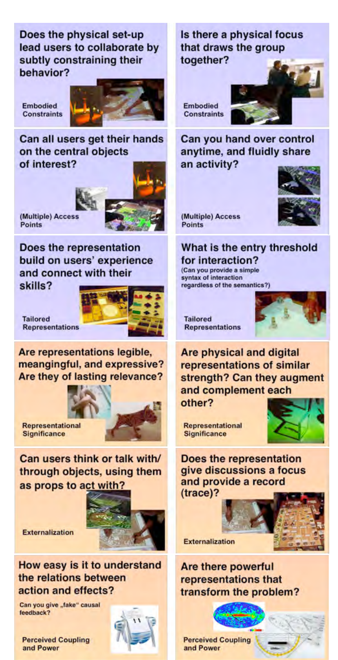
Figure 2. Embodied Facilitation (EF) and Expressive Representation (ER) cards.

appear like a list of issues that can be ticked off. Physical cards further allow participants to sort them, spread them out, stack them, and even to throw them to the side.