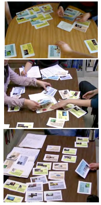
figure 3: Working with the cards

Can everybody see and follow what's happening? This is important if the device is support groups. Visibility of actions is crucial for coordination and awareness. Other visitors should be able to determine what person using the device does. This is particularly relevant in recording mode, so others can