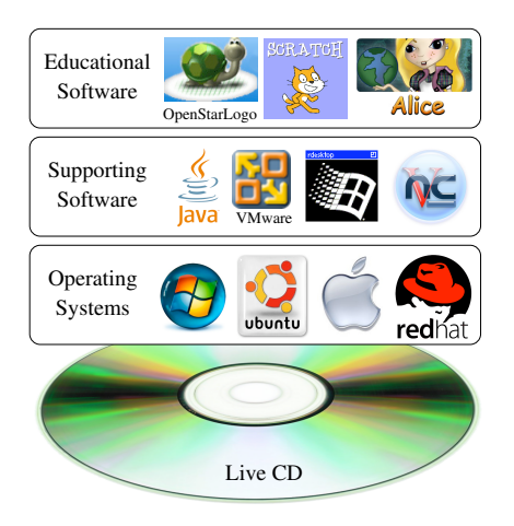
Figure 2: Anatomy of a live CD.

to take chances which enhances learning. Any mistakes can be reverted by rebooting the computer.