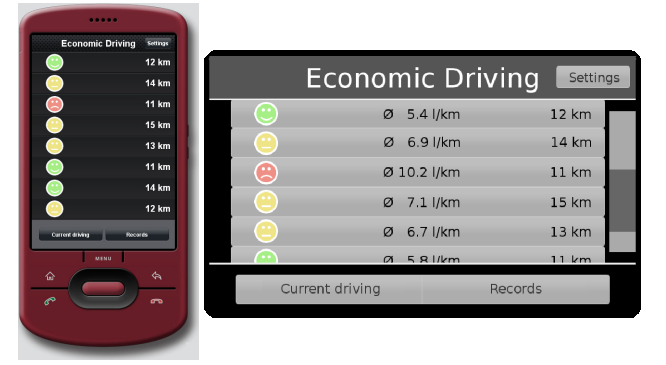
Figure 2: User interface of the economic driving application on the handheld and on the car infotainment

Consider an Economic Driving Application that uses the hardware accelerometer of a Smartphone to collect information on the intensity of the acceleration and braking while driving<sup>1</sup>. In this paper we present a similar example application that has two views, the first view is showing a colored smiley indicating the current driving behavior, the second one is showing a table listing records of the driving behavior over time. Such an application can run by its own on a Smartphone, all necessary sensor equipment being present. As this application is driving related, it is also interesting to integrate it into the car's infotainment system.