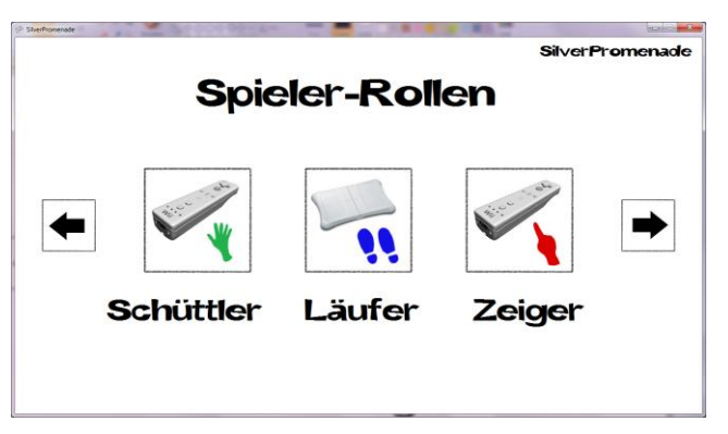
Figure 2. Main menu featuring the selection of player roles: Shaker, walker and pointer.

Regarding the graphical user interface, SilverPromenade features a linear menu structure which gradually leads the user through the