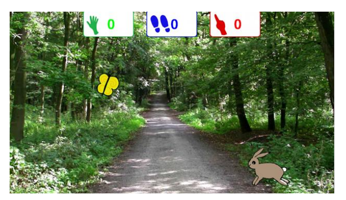
Figure 1. Players are invited to take a virtual walk through a park while competing in small mini-games.