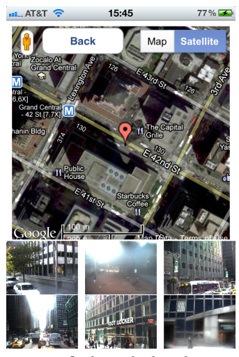
Figure 2: Our system finds and plot the top matched location (indicated by the geo tag) and associated surrounding views and points of interest in response to the given query. The user may verify the correctness of the result by comparing the surrounding views and the points of interest returned by the system.