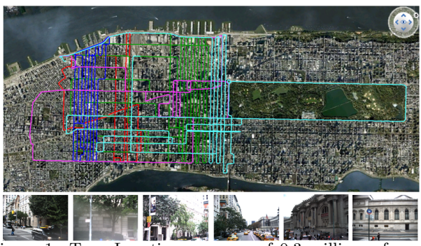
Figure 1: Top: Location coverage of 0.3 million reference images in our system; Bottom: six views of an example location in New York City.

With the popularity of mobile handheld devices, we are seeing increasing demand and promising progresses in mobile location search using visual recognition techniques. The mobile user takes a photograph of his/her surrounding view and sends the captured image over the wireless link to the server, which matches the reference images of the candidate locations stored in the server to identify the true location of the mobile user. Such visual matching capabilities can be found in several commercial systems such as snaptell [1], Nokia point and find [1], kooaba [1], as well as research prototypes [2–4]. Complementary GPS or network based lo-