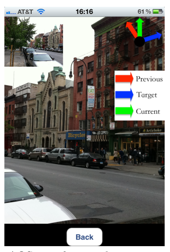
Figure 4: Our AQS interface guides users to the best view that is predicted to have a better chance of successful location search. (upper left subwindow: the previous query image, upper right arrows: the view angles of previous query, current and suggested viewing angles; the main window: the current camera view). User follows the suggestion by trying to align the green arrow with the target arrow (red).

Step 5: User follows the suggestion to turn the camera and take the next query image and send it for another location search, as shown in Figure 4.