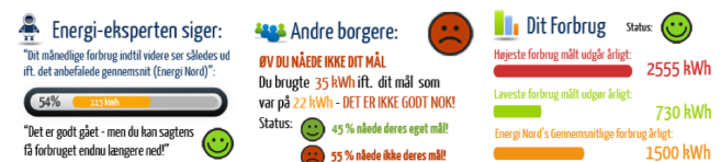
Figure 3. Messages in Power Advisor.

Power Advisor integrates personalized information for the user through a messaging service. All messages are placed in the Inbox and we use three different types of persuasive messages– (i) expert advice, (ii) community behaviour, and (iii) personal consumption performance.