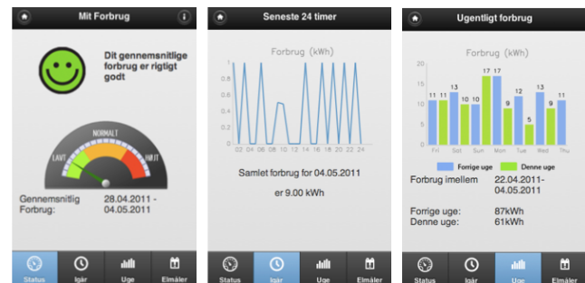
Figure 2. Three views on power consumption namely last week (injunctive), last week consumption (descriptive), and last week compared to the week before (descriptive).

The first view visualizes the total household power usage (measured as kilowatt hour) for the last week compared to the average consumption rate for a similar household in the northern part of Denmark (figure 2, left). The assessment shows whether their consumption is low, average, or high and the inclusion of a smiley supports the assessment – as suggested by [18]. The second view shows household consumption over the last 24 hours (with one measurement every hour). This is visualized as a graph (see figure 2, middle). The third view shows consumption per day for the last week compared to the week before (inspired by [22] and shown in figure 2, right). The fourth view (not shown in figure 2) displays the last meter reading. Thus, Power Advisor seeks to provide different kinds of information for assessing one's own power consumption.