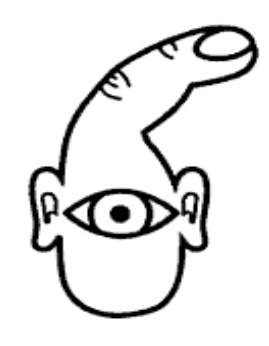
Figure 2. How the computer sees us, by O'Sullivan and Igoe, 2004.

What distinguishes our project from the Bergen group's implementation of RFC 1149 and Reid's The Bongo Project is that IPoXP situates humans at the lowest level of the Internet, inverting the HCI/CMC paradigm producing an environment in which computers interact with each other via humans. In fact, to complete the experience of the human as not a user, but an interface, we literally constructed black cardboard boxes in which xylophone