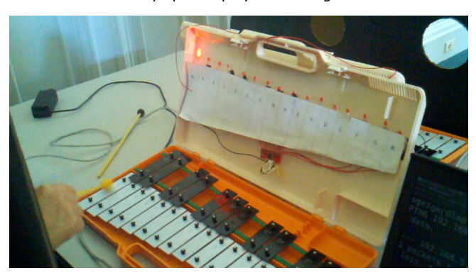
Figure 4. Xylophone lighting up the lower G note on the upper display, mallet striking the corresponding aluminum key