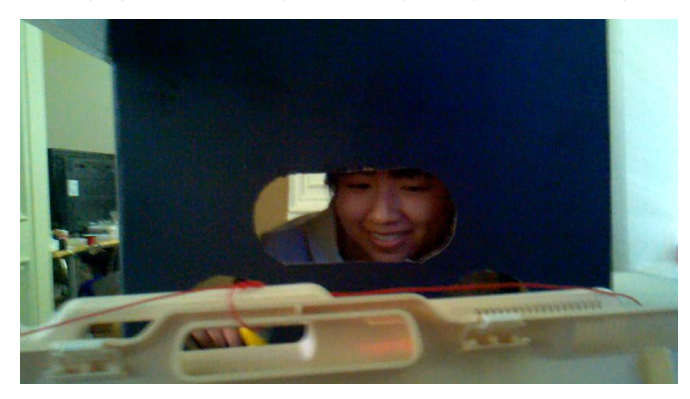
Figure 5. Human operator in the black box