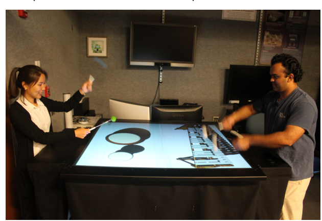
Figure 1: System Setup: Two users collaboratively performing music with our virtual musical instruments.

Copyright is held by the author/owner(s). CHI'12, May 5-10, 2012, Austin, Texas, USA. ACM 978-1-4503-1016-1/12/05.