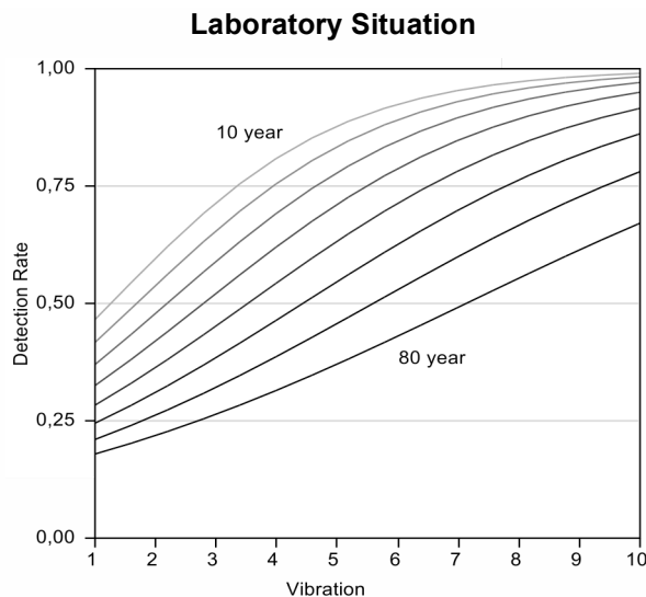
Figure 2. Detection rate with varying intensity in the lab situation, from 10 to 80 years in steps of 10 years.

Figure 3 illustrates how the method is able to quantify the effect of moving into an outdoor field situation. From the figure is evident that the detection rate decreases for all ages due to the additive effect of the situation (busy-ness), which gives a general shift in the detection rate in relation