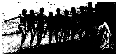
CHI '92 Challenge Participants Verify Survival of All Limbs

But are these only rumors? Have these competitions really taken place? And what is with the rumored rivalry between ToRCHI (the Toronto Region chapter) and BayCHI (the San Francisco Bay Area chapter)? Has BayCHI really won every competition with ease?