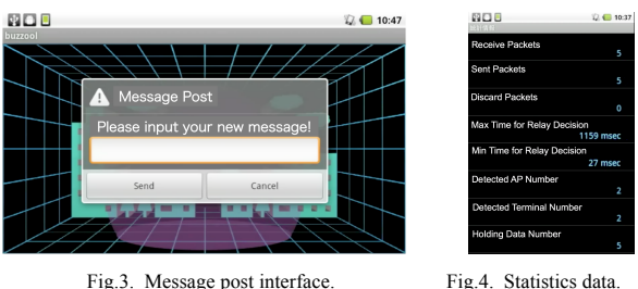
Fig.3. Message post interface.