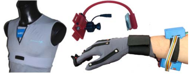
Figure 2: Newly developed wearable sensor devices. From left to right: e-Shirt, eye tracker and glove.

A multi-parameter sensing glove for the simultaneous acquisition of hand gestures and electrodermal activity (EDA) has been built [14]. Measuring both signals with a single sensor has the advantage that only one hand of the user is occupied, while the ergonomic design of the glove encourages natural movements and gestures. Both EDA and deformation signals are acquired and elaborated on-line by using the dedicated wearable and wireless electronic unit. The forearm orientation (in terms of Euler angles pitch, roll and yaw) is fixed in the dorsal part of the forearm close to the wrist. Finger position tracking is performed by means of textile deformation sensors. EDA signal acquisition is performed by using three electrodes made of conductive textile material on the index, medium and middle fingertip.