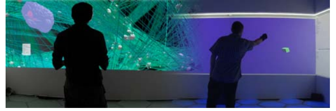
Figure 4: User interaction in the XIM.

The sentient agent, based on the Distributed Adaptive Control cognitive architecture [15], orchestrates the interaction between the user and the CEEDs application. It comprises an internal model of the user, and it possesses its own