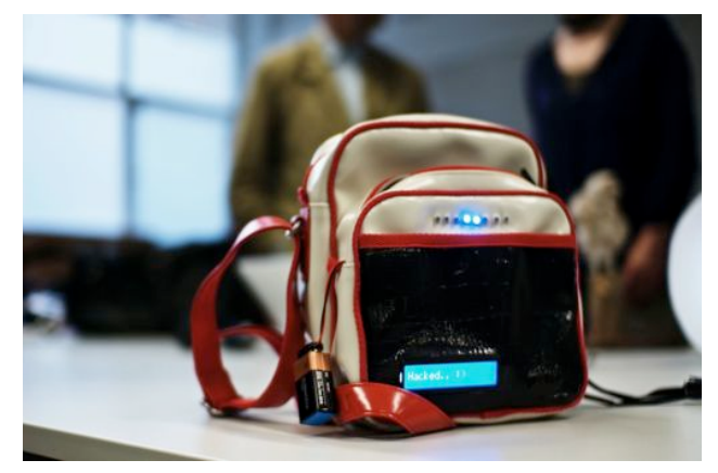
Figure 2. Early prototype of message bag.

an audio cue tells them that an item (tag) has been scanned and registered by the reader and it is just a simple beep. This could be enhanced in a way to give the user and perhaps users who are visually impaired a clearer idea of what is missing. Another change that could be implemented in the next prototype would be the use of RFID as well as near field communication (NFC) which could have the added benefit of being integrated with the users mobile phone for example or a more complex reading / writing system for the users objects.