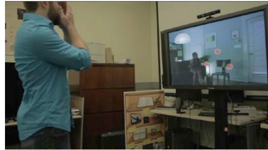
Figure 2: Peek-a-boo Interaction

Opening a door uses audio-visual cues like knocking on the door and cutting in to a close up of the doorknob. To open the door, the interactor reaches his arm forward so that the dot representing his hand touches the doorknob. He then pulls his arm back towards his body. Take hand, shown in