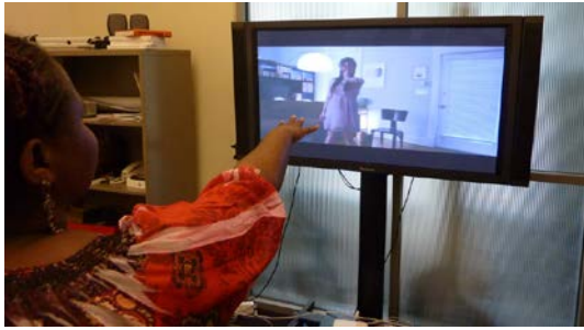
Figure 1: Take Hand Interaction

they would affect the narrative when performed. The possible scenarios that we designed started with three basic premises: