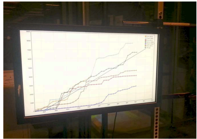
Figure 1. Watch your Steps display

Based on these experiences, we think there is an unexplored opportunity in using the context of a shared space with co-located people to encourage physical activity through social play using semi-public displays, without hiding the identity of the players and, also, providing a more informative (i.e. less metaphorical) representation of their activity. Our aim is to understand how to promote physical activity between a group of co-located people using wearable self-monitoring devices and semi-public displays.