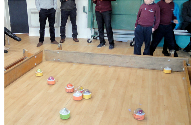
figure 1. Pupils and staff at Holmewood School, London watching robots 'perform' their personal experiences of time.

teaching methods at the University of Edinburgh that extend this principle and offers designers robots as platforms for exploring different scenarios.