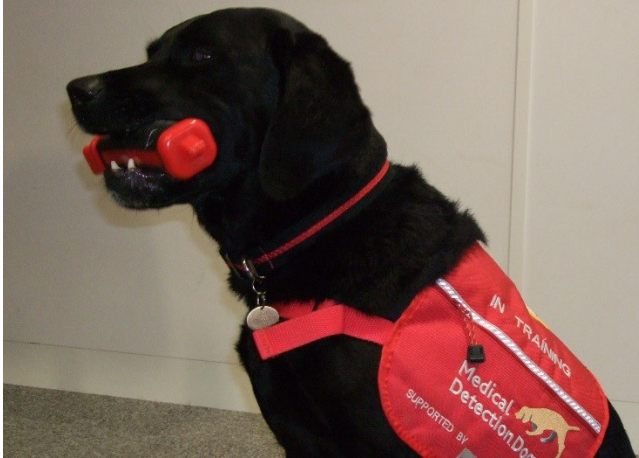
Figure 1. DAD in training dog holding a bringsel in the typical gesture made to communicate to his handler.

Due to the difficulties posed by the training process based on long-term conditioning and associations, we realized that an alarm system should be integrated within existing practices, for example, by embedding new functionalities within objects, such as bringsels, which are already in use.