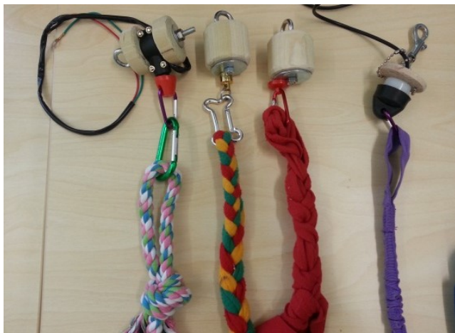
Figure 2. Physical prototypes used during testing, consisting of wooden base, trigger mechanism, and bringsel, or 'tugger' part for the dog to interact with.

Bringsel: The 'tugger' part for the dog to actually take in its mouth and pull on, to trigger the alarm call. This is the one part of the system that the dog directly manipulates to interact with the system.