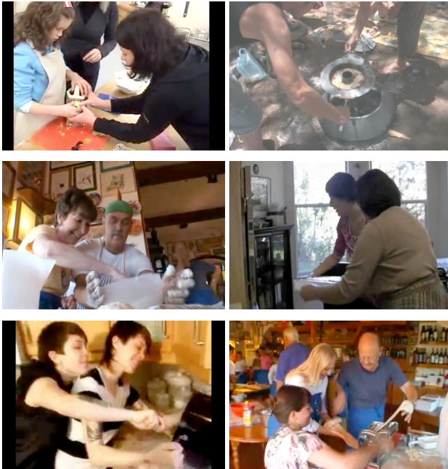
Figure 10. Helping with vis-à-vis (top row), L-shaped (middle row), and spooning and semi-circular (bottom row)

of the kitchen, the Vis-à-vis formation allows two people to help on food and tools in the transactional space between them, such as grating a piece of fruit (figure 10, top left) or shifting something hot or heavy (figure 10, top right). If working along the same side of a kitchen bench, or directly in front of an appliance, helping often takes place by entering into L-shaped or Spooning formations. As described earlier, the L-shaped formation is the less intimate of the two, and allows for the creation of a shared transactional space by standing orthogonal to each other and reaching into the area in front without breaching intimate distance and having bodily contact (figure 10, middle left and right). The Spooning configuration, however, allows two people to completely share a transactional space in front of them both, simply allowing more than one pair of hands to operate in this space, like when scraping food out of a pot (figure 10, bottom left). In Semi-circular formations, people are able to help with food or tools in their shared transactional space, like operating a pasta maker (figure 10, bottom right).