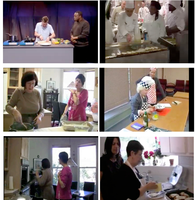
Figure 7. Observing with: L-shaped - end of bench (top row), L-shaped – along bench (middle row), and spooning (bottom row)

While cooking together is mostly an activity where all people involved are active, we further identified situations where only one person would be working or cooking while others just passively observed this person. This often happens when one person is demonstrating a cooking technique, or explaining something related to a particular cooking task or food product. It also happens when a person has finished what they were doing but the other still has something to do. In these situations people tend to enter