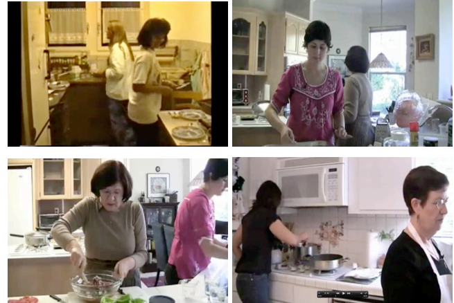
Figure 5. Working on independent tasks with: Z-shaped (top row) and reverse L-shaped (bottom row)

When cooking together people often work on related tasks, e.g. chopping up vegetables for a meal. In such situations, people will distribute sub-tasks between them, and they will often be working in parallel on tasks that are related to each other, but can advantageously be done at the same time. This often happens, for example, during the early stages of producing a meal where various food materials and ingredients need to be prepared for later stages, including cleaning and chopping up vegetables, seasoning meats, and mixing ingredients. In these situations, we found that people often work in either Side-by-side or L-shaped formation, depending on the layout of the specific kitchen (see figure 4). In kitchens with long bench tops and bench tops placed along a wall, the Side-by-side formation is prevalent. In kitchens with freestanding benches accessible from several sides, the L-shaped formation is also characteristic of this situation. The reason for these formations happening while working on related tasks is that these tasks often naturally take place in the same area of the kitchen, requiring the collaborating cooks to negotiate this space between them. This can be done by standing abreast or orthogonal to each other, depending on the layout and other affordances of the physical cooking space.