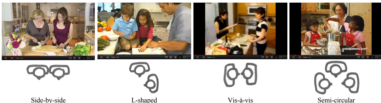
Figure 1. Known F-formations observed while cooking together

Z-shaped , and reverse L-shaped . As these eight formations all play an important part in our further analysis of interactions while cooking together presented in this paper, we will briefly describe them.