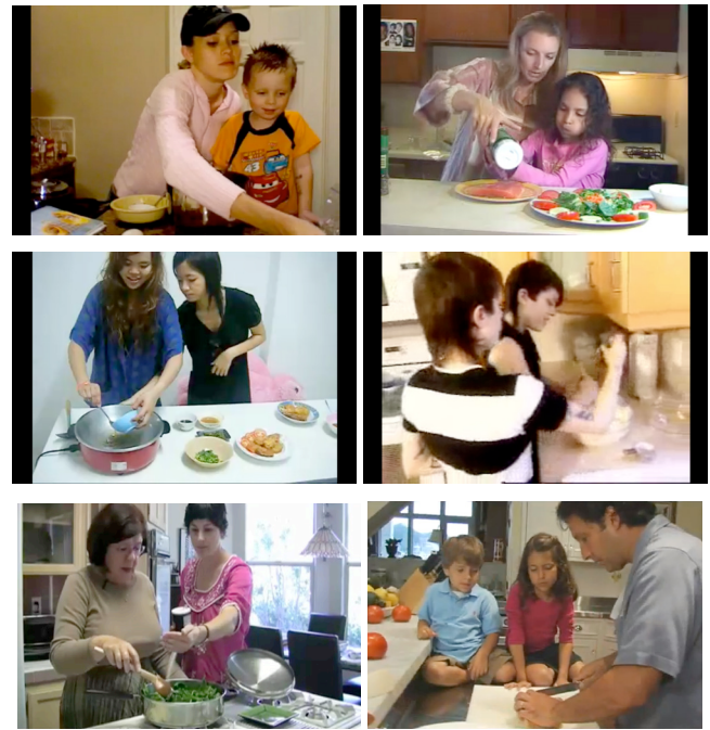
Figure 9. Showing with spooning-intimate (top row), spooning-personal (middle row), and L-shaped (bottom row)

When people cook together they sometimes need to intervene with what the other person is doing and show them how to do it, e.g. adding seasoning to a meal. This means that they will sometimes enter into the other person's transactional space and modify their actions or sometimes even take over completely. This often happens during the middle or final stages of meal production where attention to detail is important, and involves specific actions such as adding herbs or spices, stirring or turning, removing food from a heat source, changing the temperature of the oven or stove, etc. In these situations we found that people very often enter into Spooning configurations with partially or completely overlapping transactional spaces in front of them (see figure 9). The reason for this particular formation, which is not usual during, for example, normal interpersonal communication, is that intervention is often something that needs to happen quickly, and will only last for a very short time before control is handed back. Hence, when entering into a Spooning configuration one does not force the other to withdraw from the task they are working on – in fact by standing behind someone in a Spooning formation at a bench or stove it becomes rather difficult for