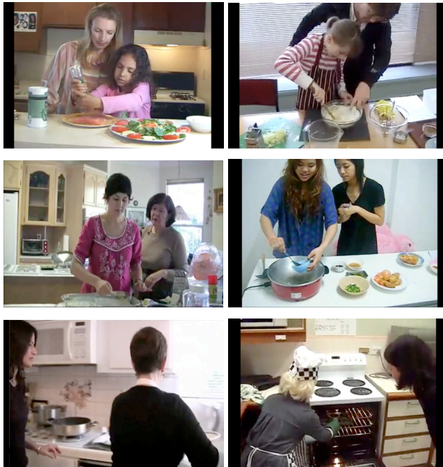
Figure 8. Checking with: spooning-intimate (top row), spooning-personal (middle row), and L-shaped (bottom row)

be able to see up close what the other person is seeing and doing. Depending on their relationship, formations are typically the Spooning or L-shaped type (see figure 8). If the collaborating cooks are intimate others (i.e. partners, parents with young children, close friends, etc.) the Spooning formation is often observed. If they are not, then more distance and personal space is usually maintained, which is possible in L-shaped formations.