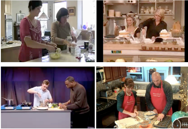
Figure 4. Working on related tasks with: side-by-side (top row) and L-shaped (bottom row)

cooking tasks, interpersonal interactions, and spatial patterns of cooks in respect to the kitchen layout.