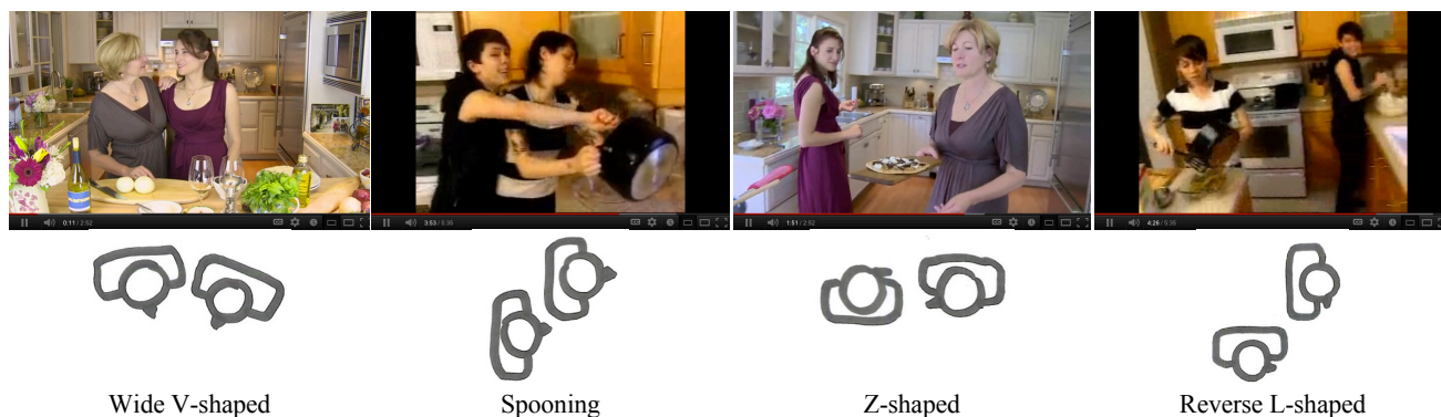
Figure 2. New formations observed while cooking together

While it is in itself interesting to observe how known F-formations appear slightly differently from purely conversational situations in the context of human-food interaction, the more remarkable finding was that the activity of shared cooking clearly made way for new formations notably different from those normally found in interpersonal communication, illustrated in Figure 2: wide V-shaped , Spooning , Z-shaped , and reverse L-shaped . The wide V-shaped formation occurs when two people are standing next to each other, but rather than facing in the same direction are turning their bodies slightly towards each other so that they are facing the same shared space in front of them. While cooking together, this formation occurs frequently when people are working along the same kitchen bench but also engaged in conversation or collaboration. The Spooning formation describes a rather intimate interaction occurring when one person approaches another from behind and enters closely into facing the same direction and sharing the same immediate space in front of them both. While cooking together this formation was often observed when the physical layout prevented other ways of