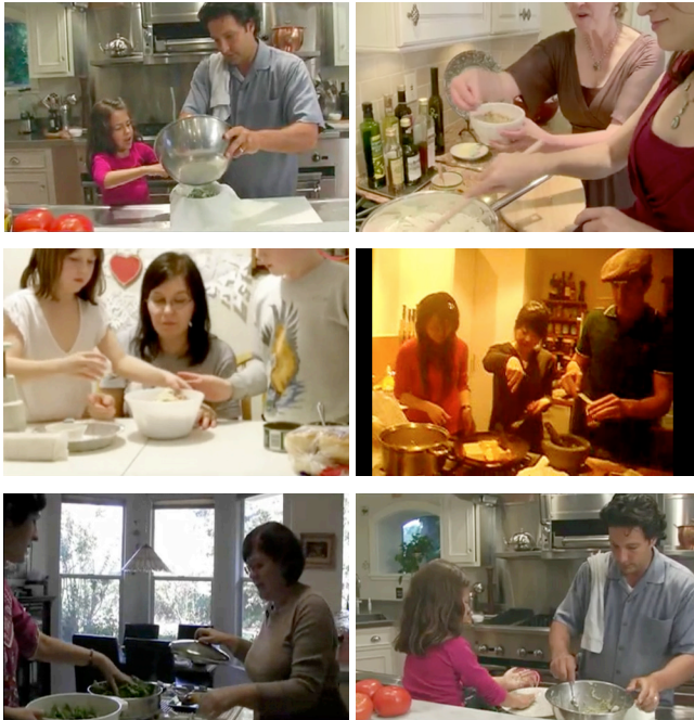
Figure 6. Working on shared tasks with: wide V-shaped (top row), semi-circular (middle row), and vis-à-vis (bottom row)

arranging the final meal, and typically involves working together on the same food materials or with the same tools. In these situations we found that people often work in wide V-shaped, Semi-circular or Vis-à-vis formations depending on group size and the layout of the kitchen (see figure 6).