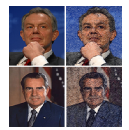
Figure 1. Two faces, clear and distorted[50, 55]

To prepare the images we attempted to foil circumvention attempts, in this case searching for the image online. Since we could not feasibly prevent searching by implementing a timeout we decided rather to distort the images. The idea was to edit each image so that its content would still be recognisable to humans but not to software such as Google Image Search. Each image was edited using age-effect filter(old photography) as well as two artistic filters (ink outline and coloured pencil). However, for a few images this was not enough to deter an online image search. In this case, the images were edited using a texture filter (fissured) and an artistic filter (coloured pencil) which gave a very similar effect to that of age-effect filters combined with ink outlines and coloured pencil vet this indeed prevented an online image Search from returning any results. We disabled the right click and gave the images anonymous names.