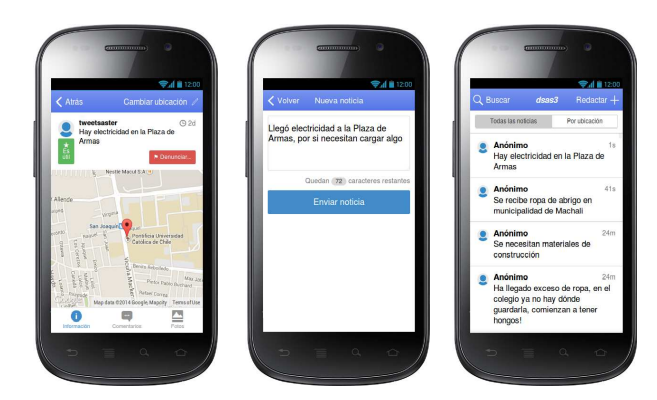
Figure 1: The mobile web application using the citizen channel.

mobile devices, to get relevant information and also to post new disaster related information that can be used by others. Figure 1 provides a few snapshots from the mobile web application in action [22].