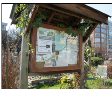
Figure 3. Notice board for sharing information.