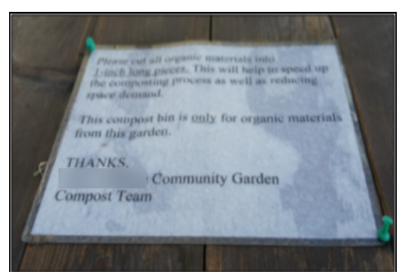
Figure 2. A weathered sign next to the compost box.