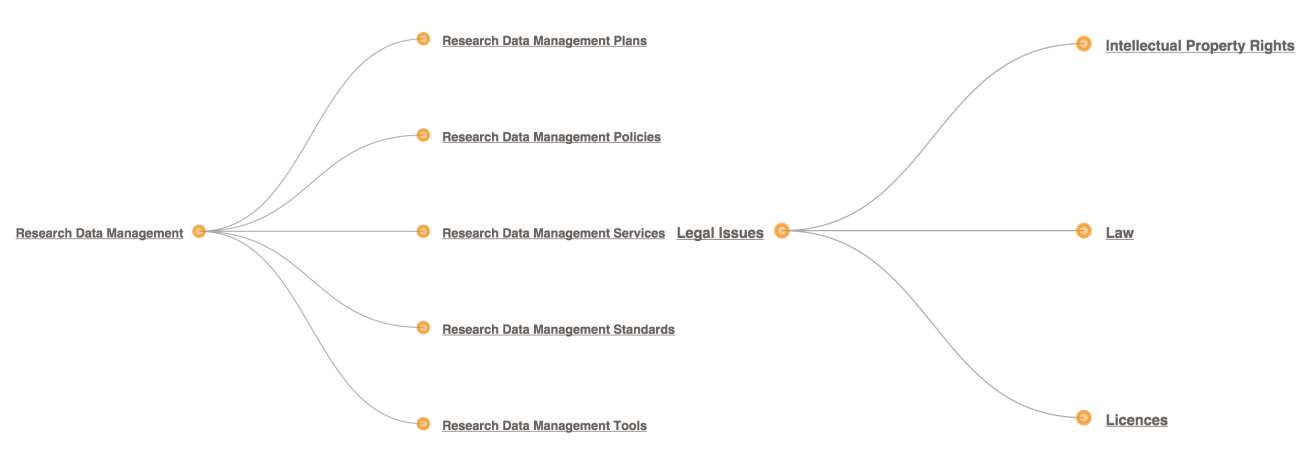
Figure 2. Research Data Management and Legal Issues Taxonomies