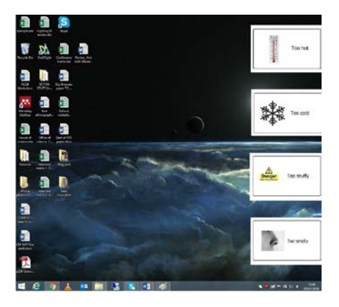
Figure 2: Potential user interface

Figure 1: Potential layout of office-situated display