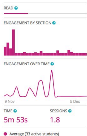
Figure 2. Document learning analytics

use the lessons learnt from large-scale learning to benefit the hundreds of millions in traditional settings.