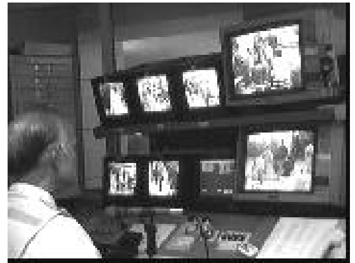
Figure 3: The technology in the Station Ops room

The organisational hub of the station is the operations room, commonly known as the 'Ops room'. In the Ops room personnel are provided with radio with which to contact other station staff, a public address system with which to make announcements to passengers, direct lines to Line Control Rooms and the police, switches to open and close gates to the station, and devices to set and reset alarms. Staff are also provided with a bank of CCTV monitors which cover principal areas of the station including the platforms, foyers, escalators and platforms (see Figure 3). The Ops room is normally staffed by one of the duty station supervisors, or a suitably trained station assistant.