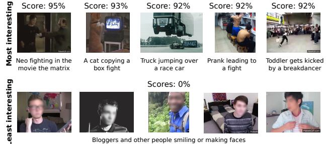
Figure 1: Most and least interesting GIFs from our dataset. GIFs of action scenes, pets and accidents are considered most interesting, while most boring GIFs are of people.

GIFs have become a very popular media, due to their unique properties. In contrast to images, animated GIFs have better capabilities to show dynamic content, tell stories and convey emotions. At the same time they remain short and without sound, which makes them more discreet and easily consumable compared to videos, which require higher time and bandwidth commitment [1].