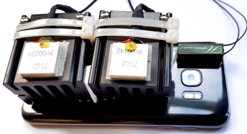
Figure 2: Device used for demonstration: Android phone with 2 x 2cm 2 Peltier devices and Haptuator Mk II on the back.

The thermal stimuli are based on the dimensional distribution from Wilson et al. [7]. The feedback designs are based on perceptual research that shows warm stimuli feel more intense and less pleasant than cool stimuli, and that increasing the extent of temperature change, or the ROC, increases the strength of sensation and makes it less pleasant/comfortable. There are also inherent links between emotion and thermal sensation [2], making it a key component of the conceptualisation and experience of emotion and these qualities can be leveraged to convey different affective qualities [7].