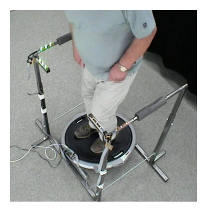
Figure 1. Stroke survivor using ActivBOSU, leaning slightly towards the right. Therefore the front-right and back-right indicators are lighted green.