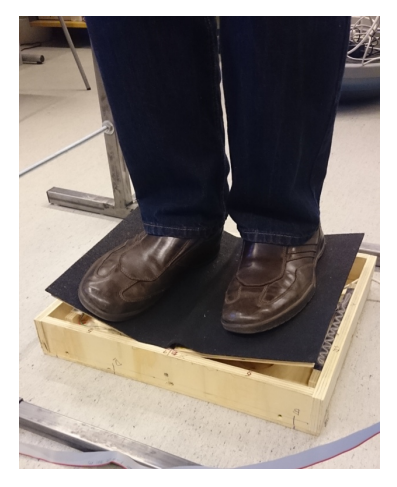
Figure 2. ActivPEDALS linked together by a rubber sheet. The same safety handle bars are used as in ActivBOSU.

Figure 1. Stroke survivor using ActivBOSU, leaning slightly towards the right. Therefore the front-right and back-right indicators are lighted green.