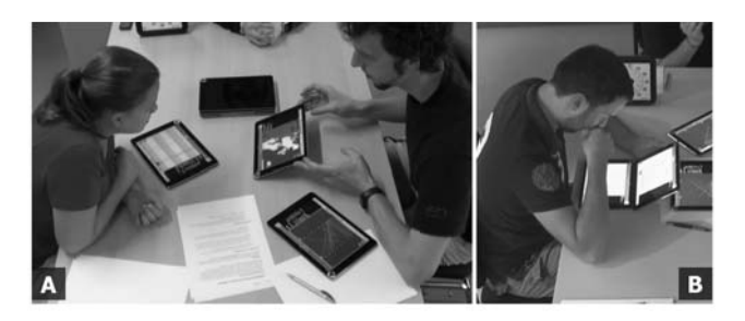
Figure 5. Tilting tablets to increase readability, facilitate comparisons, and use space above the table.

or desks by tilting devices where there would not be enough space otherwise. By this, users were also able to easily put or hold tablets side-by-side to facilitate visual comparisons (Figure 4B,5B,6B). Such spatial configurations to facilitate comparisons between two or more views were used 10 times during the study. In 6 cases the tablets were placed in a row, meaning side-by-side to the left and right edges of their screens. In 4 cases the tablets were placed in a column, meaning side-by-side to the top and bottom edges of their screens.