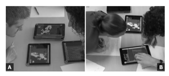
Figure 3. "One tablet per group" with tablet oriented towards the participant on the right (A) and rotated by 90 degrees to facilitate reading from both sides (B).

Furthermore, this configuration almost exclusively served loosely coupled [51] parallel work with two unlinked views instead of tightly coupled [51] collaboration across linked views. In 72 of 87 cases (79.2%), the tablets did not belong to the same pair so that there was no functional connection at all. In the other 15 of 87 cases (20.8%), it was only G5/G6/G7/G12 who picked tablets from the same pair with connected views but without exposing a clearly identifiable goal or strategy. It seemed that tablets were more or less randomly picked from the stack of available tablets and that participants hardly noticed if tablets were or were not linked. If they were, participants started to verbally coordinate their steps to avoid that the interactions by the other team member disturbed own work or vice versa, but there was no clear evidence for a deliberate and more coordinated use of cross-device functionality in the (1:1) configuration. Similarly, we only observed few cases, in which participants closely worked together by putting their devices side-by-side, e.g., to visually compare them with or without a functional connection. This only happened in 15 of 87 cases (17.2%).