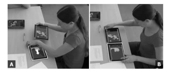
Figure 4. Physical reconfiguration of workspace.