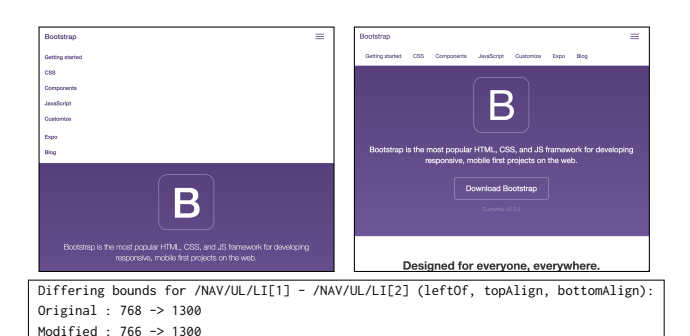
Figure 3: The original version of getbootstrap.com (top-left), the incrementally modified version (top-right), and a snippet of the report produced by REDECHECK (bottom).

To investigate the prevalence of the five common types of RLFs in real-world web pages and evaluate REDECHECK's ability to detect them, we ran the tool on a corpus of 26 randomly collected web pages of varying complexity and domain. REDECHECK found RLFs of all five common types. Well over half of the web pages, including well-known ones such as Duolingo and Consumer Reports , contained RLFs [18]. Since these pages were all in production use and, we surmise, already subject to extensive testing, this result emphasises the importance and real-world relevance of the presented tool, further underscoring the benefits of using REDECHECK's automated layout checkers. This empirical study also revealed that REDECHECK outperformed several spotchecking approaches. For instance, a manual spotcheck missed Duolingo 's layout failure, as highlighted in Figure 1, illustrating the error-prone nature of current industrial quality assurance practices for responsive pages.