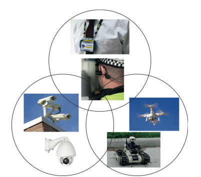
Figure 4: Camera network platforms vary, leading to platform heterogeneity. BWV/IBV has received little attention so far from the research community.