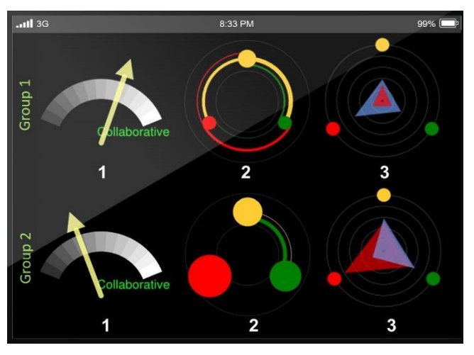
Figure 3. A multi-modal learning analytics dashboard.

The second case that illustrates our approach is a Learning Dashboard designed to be used by teachers in their classrooms [16]. This shows multi-modal information of students' small group collaboration. The representational translation (Enacting-Symbolising) was performed when the students interacted with a multi-touch interactive tabletop to build a joint artefact. The computer Symbolised and Processed the physical interactions between students and the tabletop, their conversations captured using mic-arrays, and changes in the learning artefact. The resulting distilled information was presented in a dashboard (Processing-Analogising aspect in our view) which expressed the computation of students' data (apparently) suitable for the teacher's in a form interpretation.