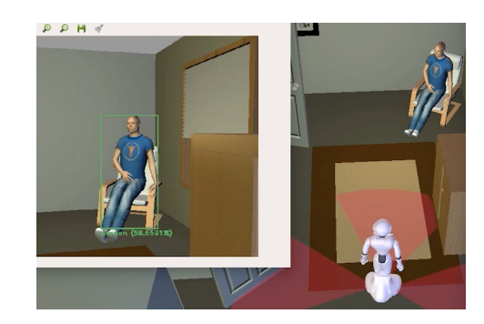
Figure 3: External people detection component (top left) uses the simulated camera images.

As depicted in Figure 2 (speech tab), the simulation also features so-called "fake say" and "fake-recognize" actuators and sensors which can be used via the GUI or command line. These are useful to, e.g., test/verify if a scenario has been modeled correctly — in a behavior state-machine for example.