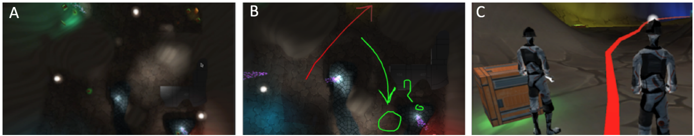
Figure 1. A: The top-down map allows players to see part of the play space to develop strategies and plans. B: Players use the mouse cursor to draw on the map to establish plans and strategies. Drawings are colored differently to identify and follow. C: The drawing is made visible directly on the gameworld, enabling its use during action gameplay, which gives the players the ability to follow their plan, and to develop it in real time.